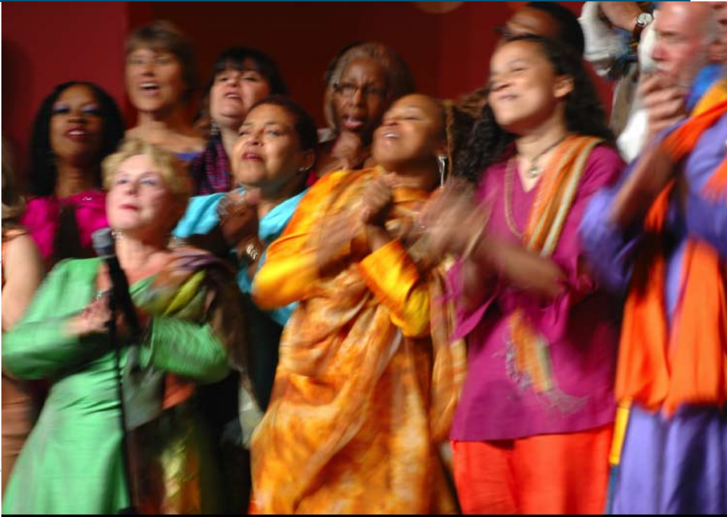
Photo. Agape Choir at The World Parliament of Religions, Melbourne, Australia