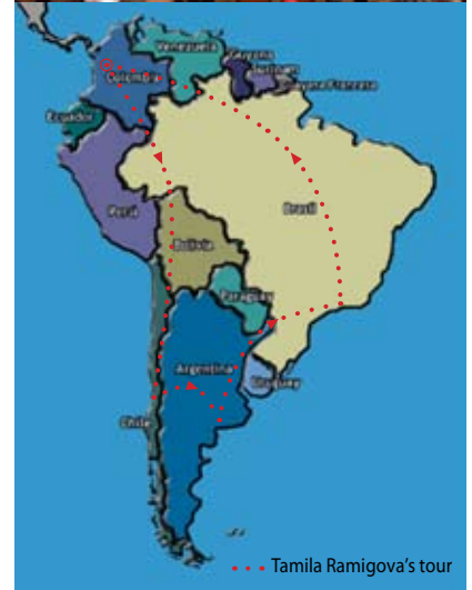
--- Tamila Ramigova's tour