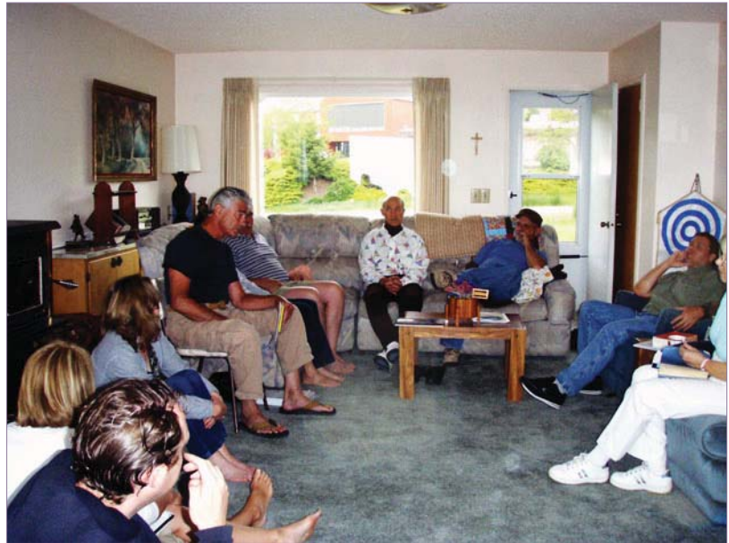
Group picture. More photos at http://www.urantia-uai.org/photos/index.html

and a functional kitchen. This quaint old farm house with its awe inspiring view of the prairie below has been home to Idaho Urantia Association gatherings for eleven consecutive Memorial Day Weekends.