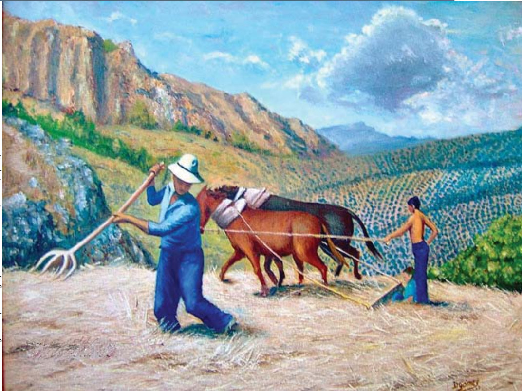
"The threshing floor" painting by Demetrio Gomez (Madrid, Spain)