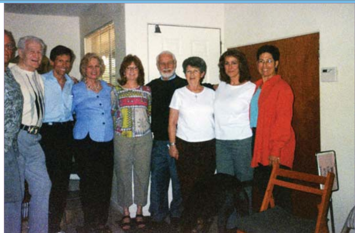
Arizona group photo

Toby Fox did a presentation titled, "The Mastery of Communion," a how-to guide to removing the roadblocks to direct Adjuster communion. A foundation for mastery was built around achieving a mind of perfect poise, housed in a body of clean habits, stabilized