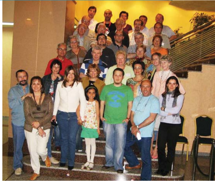
Group picture. More photos at http://www.urantia-uai.org/photos/index.html

As part of our program activities, as usual, we held an assembly of our Association, when we informed our members about international and national projects. Our