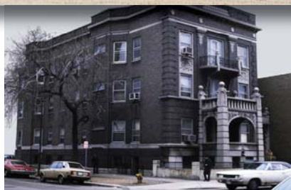
Urantia Foundation, 533 Diversey, Chicago