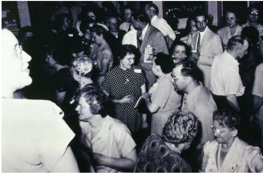
Forum party 1930's