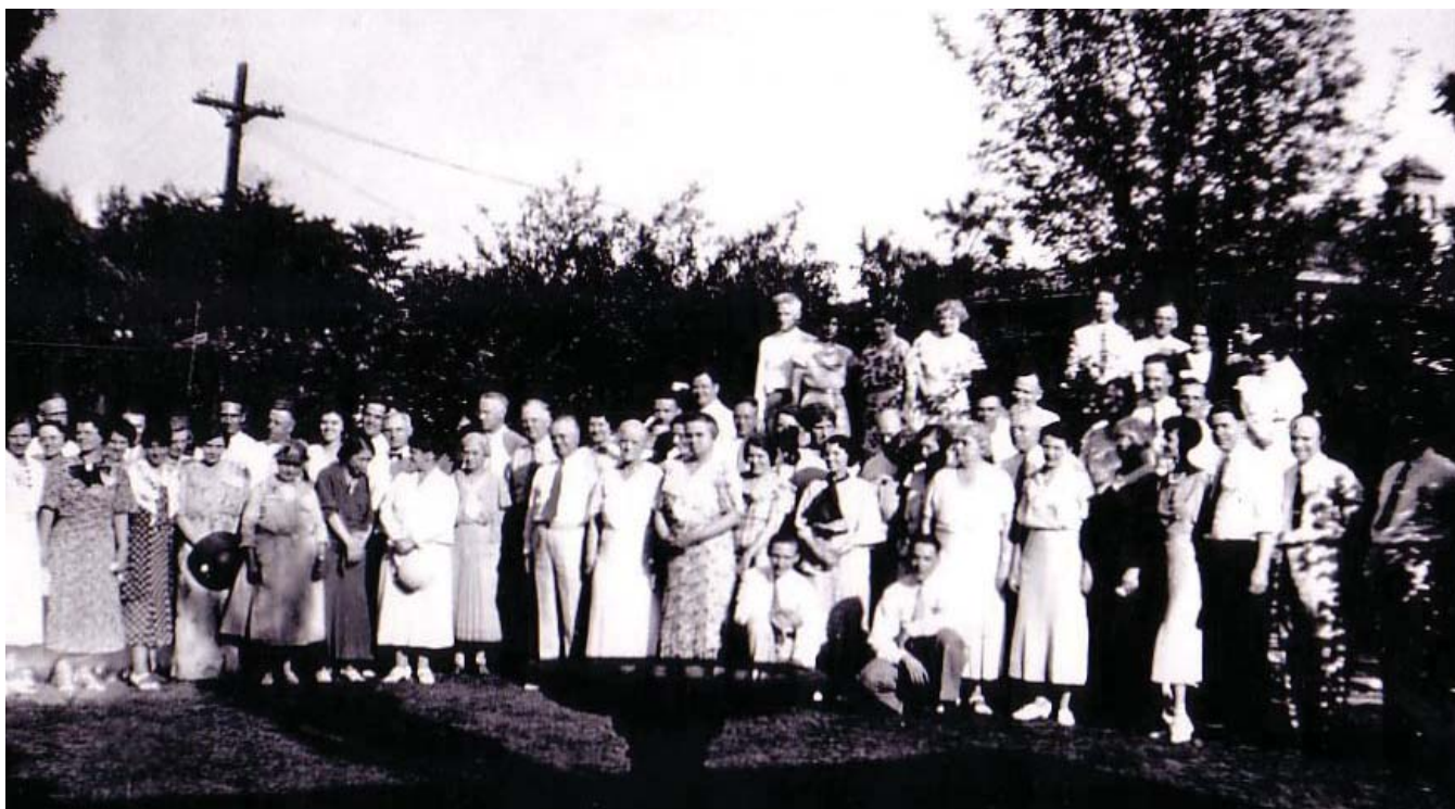
SUMMER PICNIC. A group of participants during the early Forum years at Beverly Shores, Indiana, mid-1930's.