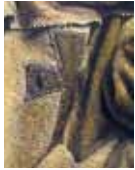
JESUS OF NAZARETH

T HEN JESUS SPOKE SAYING: “Now that you are ambassadors of my Father’s kingdom, you have thereby become a class of men separate and distinct from all other men on earth. You are not now as men among men but as the enlightened citizens of another and heavenly country among the ignorant creatures of this dark world. Of the teacher more is expected than of the pupil; of the master more is required than of the servant. Of the citizens of the heavenly kingdom more is required than of the citizens of the earthly rule. Some of the things which I am about to say to you may seem hard, but you have elected to represent me in the world even as I now represent the Father; and as my agents on earth you will be obligated to abide by those teachings and practices which are reflective of my ideals of mortal living on the worlds of space, and which I exemplify in my earth life of revealing the Father who is in heaven.