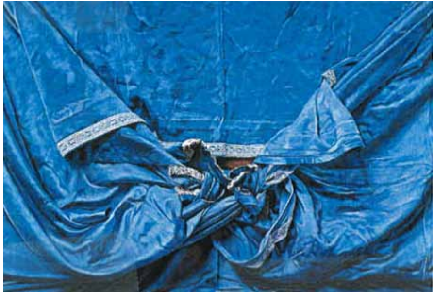
Tying the knot of dedicated service

“I warn you against false prophets who will come to you in sheep’s clothing, while on the inside they are as ravening wolves. By their fruits you shall know them. Do men gather grapes from thorns or figs from thistles? Even so, every good tree brings forth good fruit, but the corrupt tree bears evil fruit. . . . In gaining an entrance into the kingdom of heaven, it is the motive that