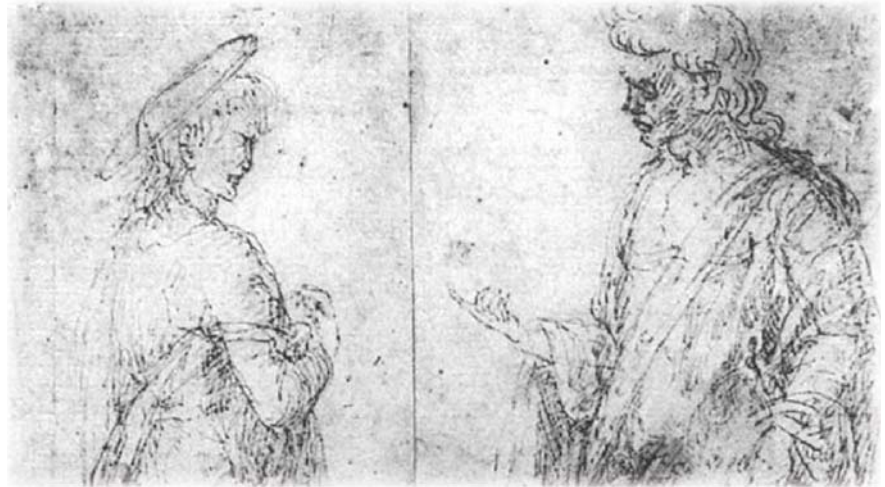
"Two Apostles" Francesco di Giorgio Martini, 1490