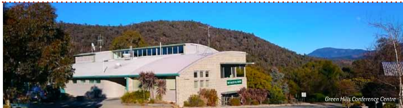
Green Hills Conference Centre