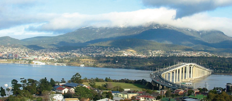
Approach to Hobart—Tasman Bridge over the Derwent River, Mt Wellington behind, shrouded in clouds.

Urantia is poised to experience a spiritual revolution, the likes of which has never been witnessed before on this planet: