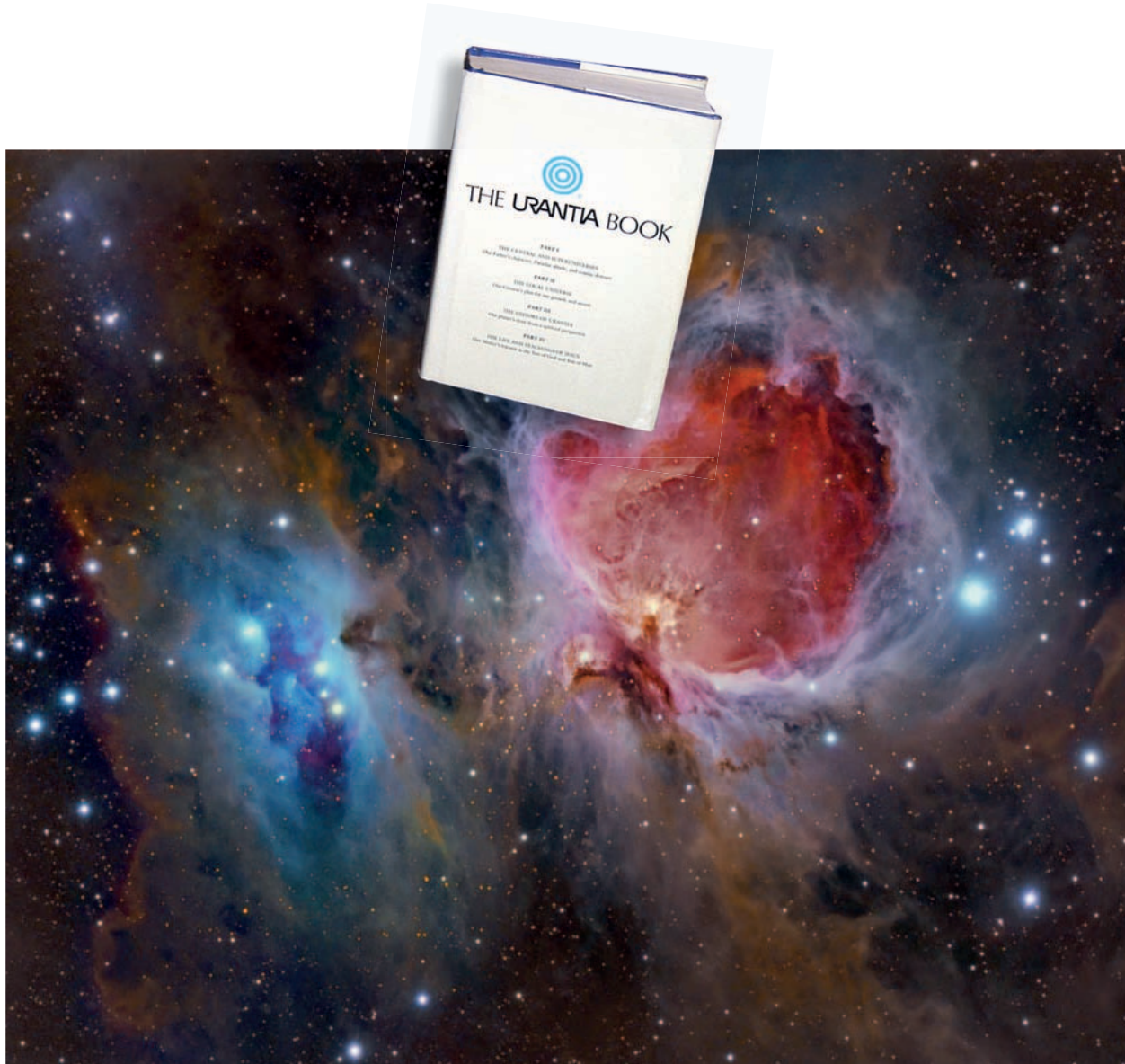
Great Orion Nebula photo

These are my hopes—let's see what the future brings. ■