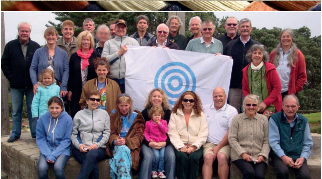
Group photo at Long Bay NZ