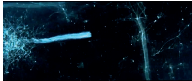
Microscopic slide of brain neurons

be termed associative creativity. In other words, if we humans want to say “Let there be Light”, first we must build a generator. This type of creativity is demonstrated vividly in the way that the brain functions, as the synapses zap between the neurons making associations between ideas. There are somewhere around a trillion neurons and a quadrillion synapses, so there is a multiplicity of new ideas waiting to be connected in everyone's brain!