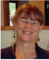
By Marion Steward, Auckland, New Zealand

Presented at the New Zealand Conference October, 2014