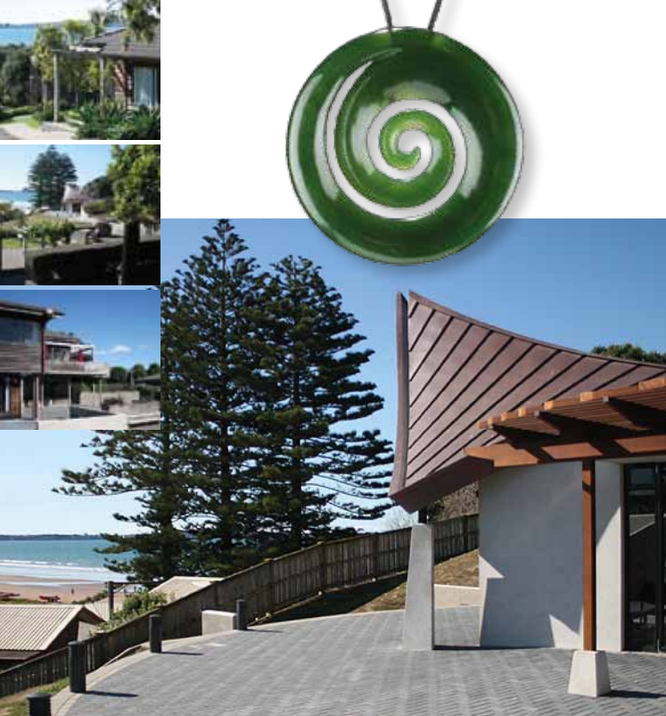
Vaughan Park Anglican Retreat Centre

We invite you to join us at this year's ANZURA conference to celebrate together all of God's gifts to us, and to explore how, individually and together, we may live our lives on Urantia more creatively.