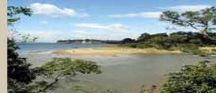
Long Bay NZ

Venue Vaughan Park Retreat and Conference Centre, 1043 Beach Road, Long Bay, Auckland City 0630, New Zealand, is at the south end of Long Bay Beach in the East Coast Bays. It is in a tranquil setting, consisting of a number of lodges and meeting rooms, and a beautiful chapel with stunning views of the beach and the Waitemata Harbour.